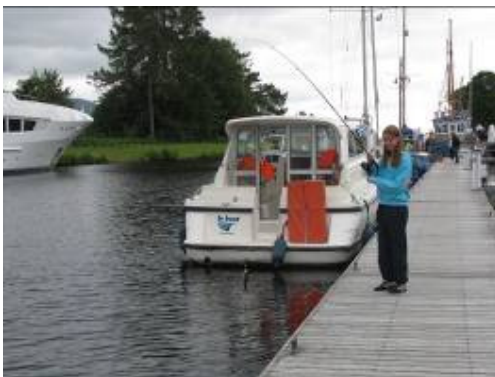
Me with Jaws

Today we passed one lock and two bridges. Leaving around 8:15 we immediately got into the lock, then past the first bridge and it was plain sailing (motoring) from then on! Just about a mile after the first bridge there was Moy Swing Bridge and then after roughly four more miles we had arrived. We stayed at the top of Neptune's staircase, apparently it's safer but I've no idea. Anyway! When we were moored Dad and I went into Fort William to go shopping and get some other bits and pieces. Once we were back I went fishing and I caught a rainbow trout...greedy little thing (the spinner was half it's size!). Catching a fish was NOT repeat NOT part of the plan! A little later a Caley cruiser came along which was too big for the space but he was going in no matter what. The guy went a little too far forward and then straight back into our deck level nav lights pushing them backwards. Although I hasten to add that both boats and all people were fine.