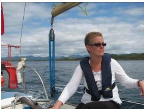
Mum on the Helm