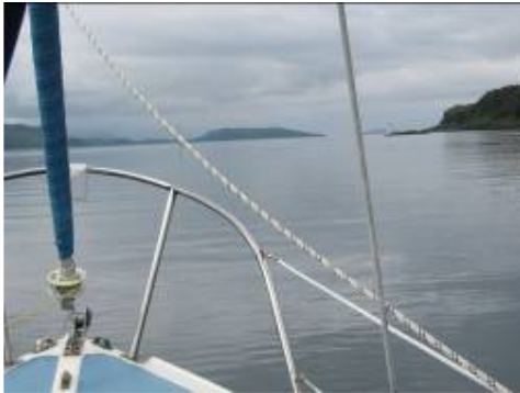
Sound of Kerrera

OH! MY! GOSH! I was officially knackered. I had been doing the locks. After leaving Oban we went through the Sound of Kerrera, then headed between Insh island and Seil before passing west of Easedale and down through the Sound of Luing. We then went through the Dorus Mor to Crinan and into the canal. I saw more dolphins. In the north part of the Sound of Luing, justb after passing Fladda, we were doing 9.7 knots over the ground! We were only doing 4.1 knots through the water, that's 5.6 knots of tide! We would have been going backwards if the tide was running the other way. We also passed channels that could take you to the Gulf of Corryvreckan and Little Corryvreckan. The sea lock in the Crinan Canal was very bouncy and Dad got a bit wet while he was doing the bow rope.