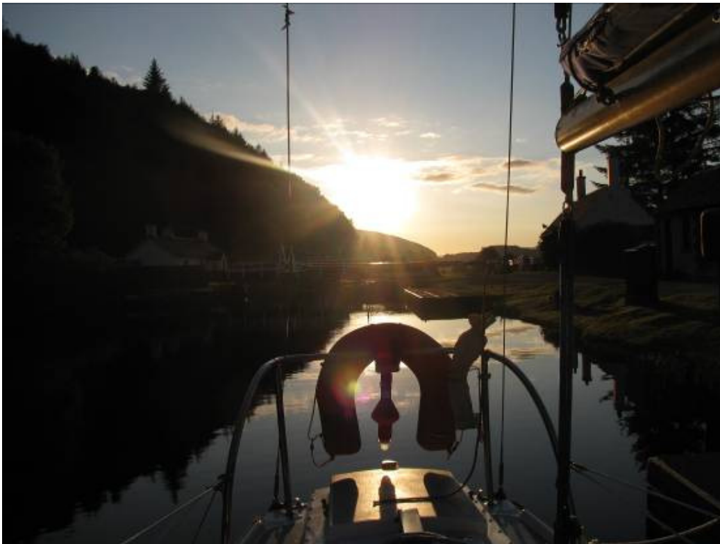
Moored at Dunardry Locks, Crinan Canal