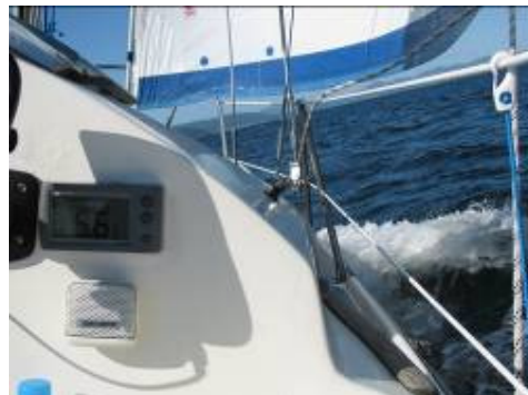
Heading for Kip