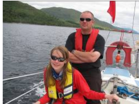
Me on the helm