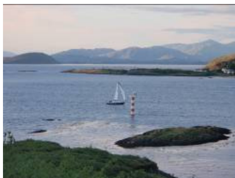
The North entrance to Oban Bay