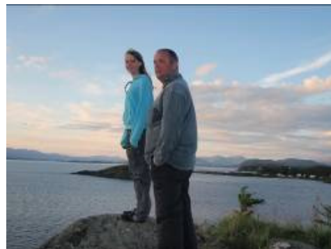
Me and Dad on Kerrera