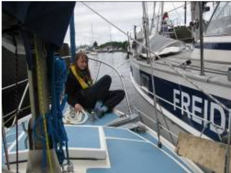
Being towed to the sea lock

Getting up early isn't fun, but sleeping is, and I've done a lot of it today. After going into Neptune's staircase I had a chocolate biscuit because I was starving and whilst we were in the last lock we were rafted up to a very nice Norwegian family's Halberg-Rassay 49 and they towed us all the way to the sea lock. Then when we were out we had our breakfast and I fell asleep for a couple of hours. When I woke up the Jenny was out and I got to put it away. Then I went up to the bow and read my book for a bit. When we got near Oban we slowed to let the Mull ferry get into Oban bay ahead before we followed it in and went into the marina on Kerrera. We got the little marina ferry over to Oban where I got three new books (Gallagher girls 3+4 and Morganville vampires book 3)! Then we had dinner at a nice Italian restaurant and got the ferry back to the marina. This is a very pretty place!